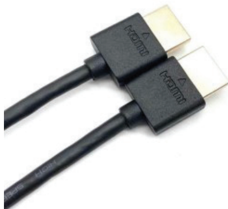
Cat. No: HDMIV20-1